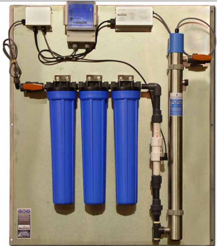
Pictured System with Electronic Descaler. Configurations may vary.

This residential/commercial water purification system offers very efficient water treatment at a low cost per unit volume.