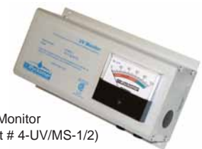
UV Monitor (Part # 4-UV/MS-1/2)

Monitoring System - For those applications that require fail-safe operation, a monitoring system can be added. This consists of a sensor that measures the intensity of the UV light in real-time, and displays it on a meter face on the monitor. In case the intensity goes below the recommended dosage for drinking water, the monitor can trigger a solenoid valve to shut off the flow of water until the problem has been rectified.